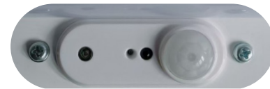
BUILT-IN Bi-Level Sensor