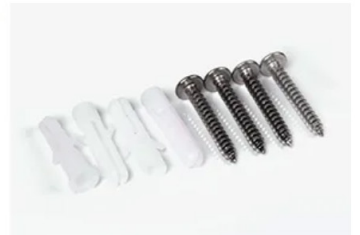
Mounting Screws included