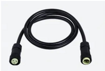
LC (Link Cable)