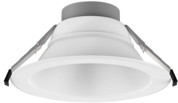
3 set dip switch for CCT and Wattage